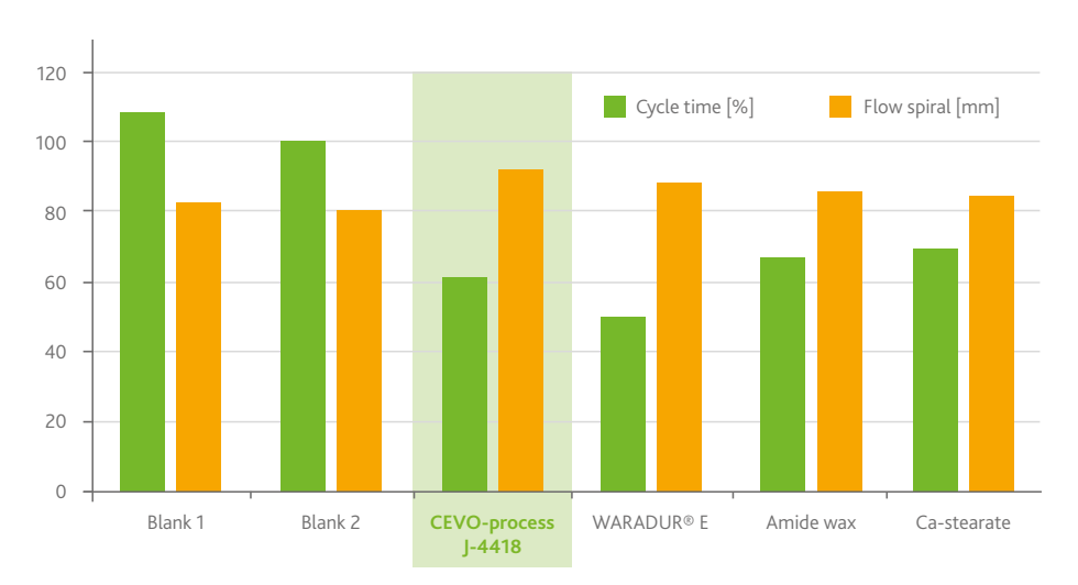
Figure 1: Cycle time reduction and flow improvement

The best flow result was achieved with CEVO-process J-4418. The flow spirals are longer than the reference by >15%. The extension in the equipment set-up used with WARADUR® E is about 8%. Calcium stearate and amide wax: ca. 5-5.5%.