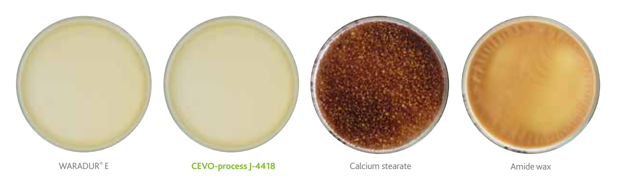
Figure 4: Colour stability under thermal stress (Laboratory Air Circulation Oven Heraeus UT 6120: 250 °C/30 min; Ca-stearate: 10 min)

This low volatility is combined with good colour stability (Figure 4), especially in comparison to amide wax and Ca-stearate.